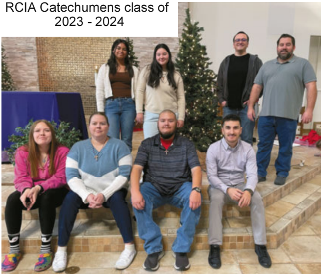
RCIA Catechumens class of 2023 - 2024