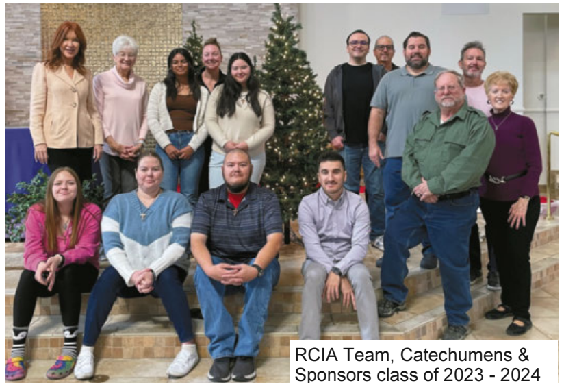
RCIA Team, Catechumens & Sponsors class of 2023 - 2024

Did you ever wonder who assembled all the trees used throughout the church during our Christmas Masses? The answer is RCIA! Not only did they put up the trees - they also took them down. Next time you see an RCIA member - extend a huge Thank YOU!